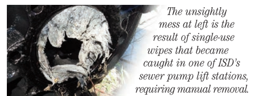
The unsightly mess at left is the result of single-use wipes that became caught in one of ISD’s sewer pump lift stations, requiring manual removal.

Please do your part to keep things flowing properly by throwing wipes in the trash where they belong and not in your toilet. □