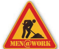
Understanding ISD’s Sewer System Management Plan

Even though some wipes claim they are flushable or safe for sewers, they do not decompose properly and contribute to clogs in sewer pipes.