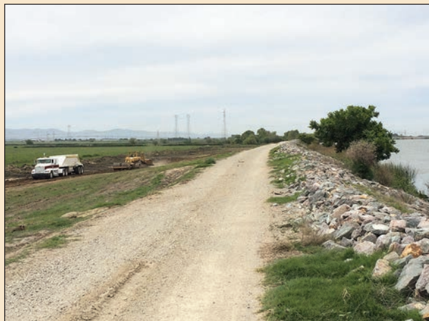
Workers with ASTA Construction Co., Inc. haul dirt to improve 5,000 feet of levee on ISD-owned Jersey Island. The project is needed to prepare for a rock barrier on adjacent False River, visible at right.

In March, the California Department of Water Resources reported that due to the state's third straight dry year, and the driest on record in 2013, officials were planning to guard against saltwater intrusion moving up river in the Sacramento-San Joaquin Delta by building three barriers along the rivers. One of those barriers was to be located in False River, adjacent to